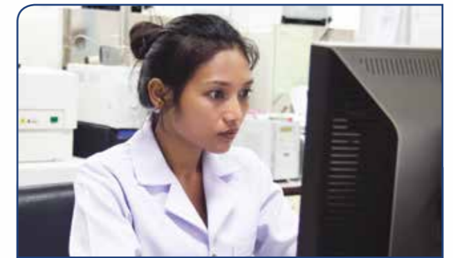
Technical support based on local specifications and local materials