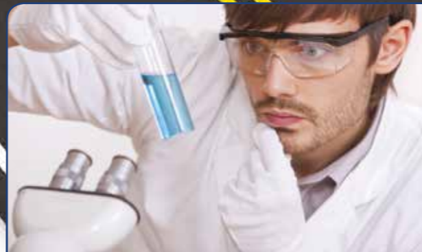
Well-equipped research and technical support laboratories in various parts of the world