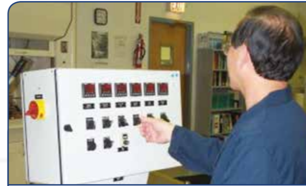
Highly skilled technical staff and technically sound Sales & Marketing team dedicated to our asphalt customers