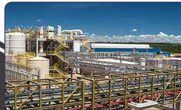
Global manufacturing locations and local stock to deliver products on time to fulfill the needs of our customers