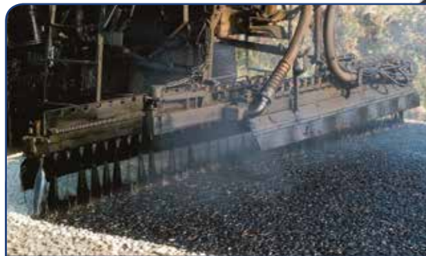
Proven high quality products for various asphalt applications

We are one of the world's leading specialty chemical manufacturers and its products have served the road industry since the 1940's. We deliver adhesion promoters, emulsifiers, warm mix additives and technical support for the road construction and maintenance industry from our worldwide manufacturing locations and technical service centers. We offer the following to our customers.