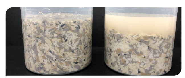
Hectorite solution thickened by Finnfix® 4000G*