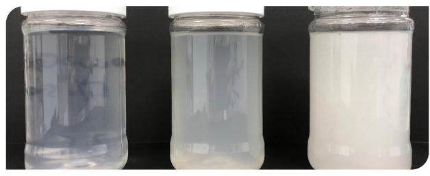
Finnfix® 4000G Competitor 1