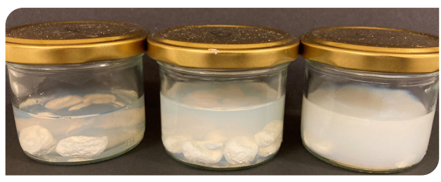
Bermocoll® EHM500 – no binder migration