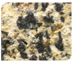
Higher dosage – more textured for colored particle