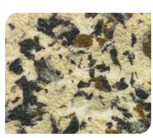
Lower dosage – more flat for colored particle