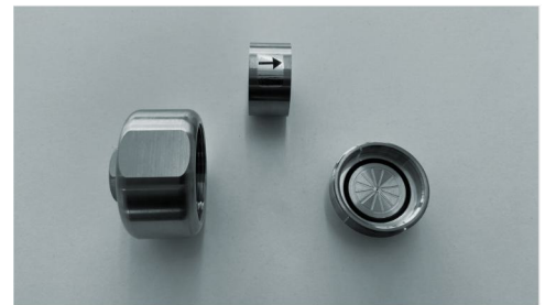
A cartridge and the holder parts

1 - Insert the guard cartridge into the column holder short body part. Take note of the recommended flow direction.