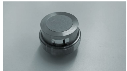
The cartridge in the holder

It is recommended that this seal is not disturbed until the guard cartridge reaches the end of its useful life.