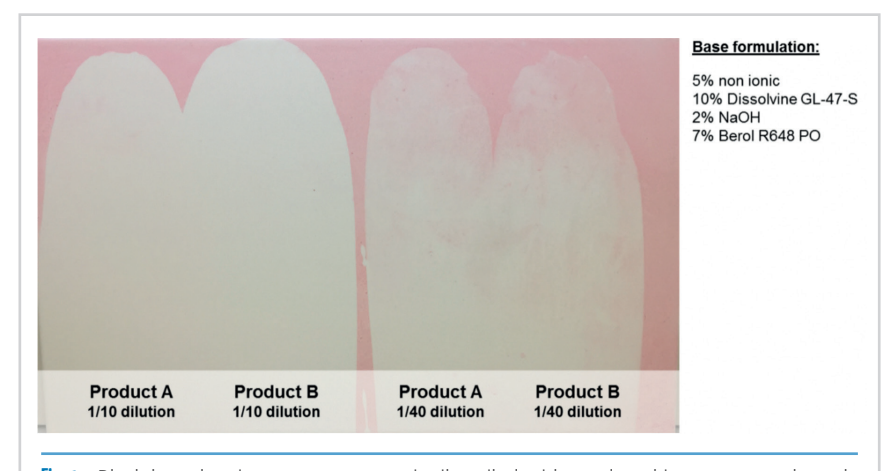
Fig.1 Black box cleaning test on a ceramic tile soiled with used cooking grease and aged for 5 hours at 60°C.

Obviously, product B is the more sustainable option in this case. In Fig. 1 , we show the black box test results comparing 5% non-ionic primary surfactant products A + B when incorporated into a simple framework cleaning formulation at two dilu-